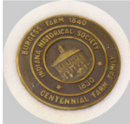
Photo of an Indiana Historical Society's Centennial Farm Family Plaque that had been awarded to the Burgess Family

For more information about this book please visit the Indiana Historical Society's Website - Family History Book Section http://www.indianahistory.org/historymarket/store/