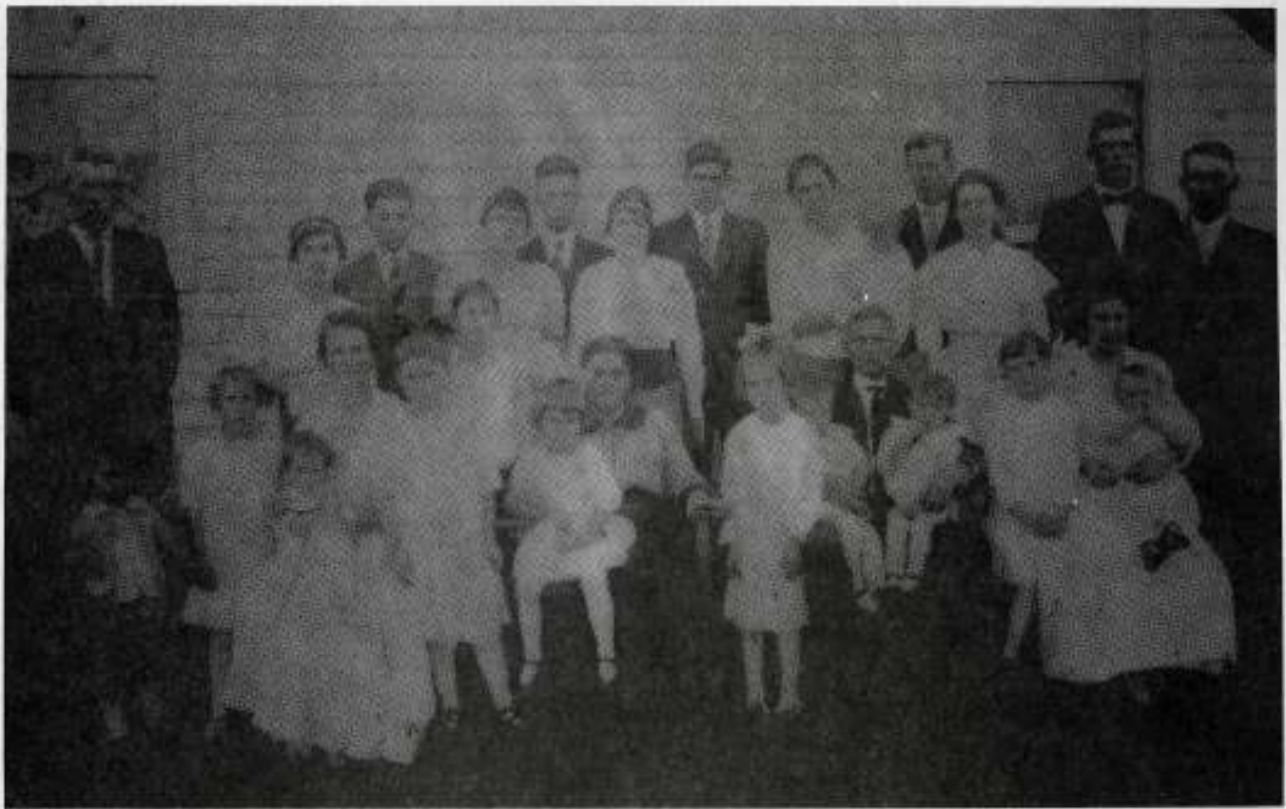
This is the complete family with grandchildren and son and daughters-in-law.