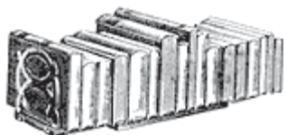
Circulation Service Stats by Month